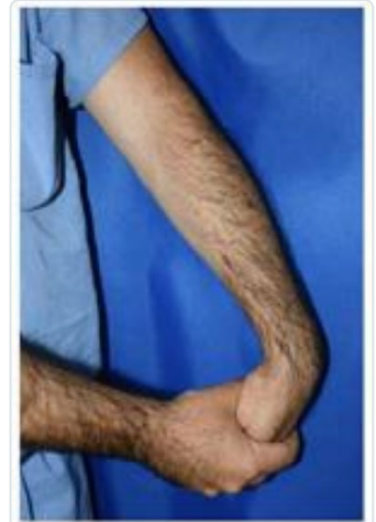
Wrist stretching exercise with elbow extended.

If your symptoms do not respond after 6 to 12 months of nonsurgical treatments, your doctor may recommend surgery.